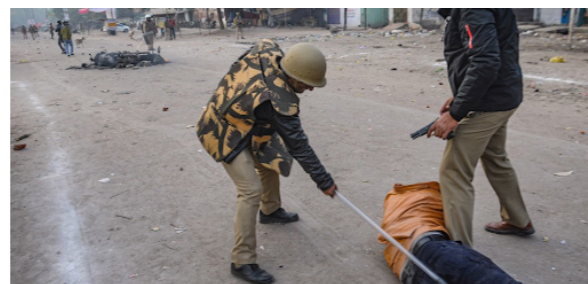
Figure 7: Police attacked civilians during the anti-CAA-NPR-NRC protests in Kanpur, December 2020.

The continuous nature of trauma often changes the victims' everyday lives and interactions, reproducing its effects in how they interact with the world, primarily through their religious identity and their decisions about where and how they choose to travel, whom they sit down with, and how much and with whom they speak. The core beliefs of victims are transformed, increasing their watchfulness and susceptibility to anxious thoughts as their trust in a predictable and peaceful world is disrupted by communal violence. 42