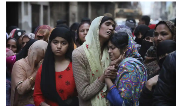
Figure 6: Relatives of a victim of Delhi pogrom in mourning.

(It has become a habit of mine to keep taking pills meant for kidney stones).”