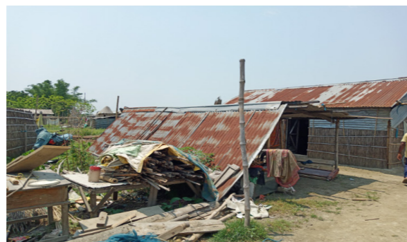
Figure 4: The rebuilt houses of Dhalpur, Village 1, Assam.

is no longer theirs. They don't have land, like us. They do daily-wage labour to survive. They are trying to look after themselves. It has been hard for her to manage. She cannot do labour and has three children to look after.”