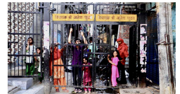
Figure 8: Residents of Jahangirpura, a Muslim dominated neighbourhood, which faced demolition drives after the Ram Navami violence in April 2022.