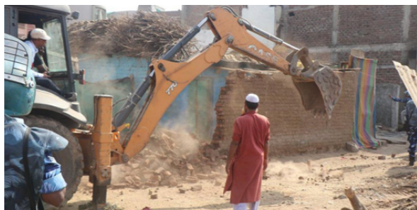
Figure 1: A house being demolished in Khargone, Madhya Pradesh in the aftermath of the Ram Navami violence in April 2022.

Under the electoral and political system dominated by the BJP, the application of the rule of law is contingent upon one's religion. This “irregular” functioning of the law entails blocking access to legal recourse and accountability, undermining the democratic setup based on a system of checks and balances. 36 Muslims in India today are facing an “institutional betrayal,” which is the erosion of reason and expectation from the law i.e. the law will work on universal morality and not on a skewed understanding of “Muslim guilt” and “Savarna innocence.” 37 These processes run parallel to the operation of “ethnicised patronage networks,” which work as unofficial state structures to help majority communities secure favours from the government, police, and courts. 38