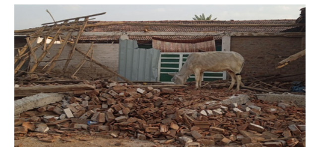
Figure 3: House demolished by bulldozers in Khamaria, Madhya Pradesh, April 2022.

referring to the specific targeting of Muslims by the police. Congregated in the veranda of their house, Muslim women described how their fathers, husbands and sons had been taken away by the police under the garb of providing medical help, leaving them alone to handle their households and each other. They cried, “Kya humare pet nahi hai? Kya humare bacche nahi hai jinhe school jana hai? (Do we not have to feed ourselves? Do we not have children who need to go to school?).”