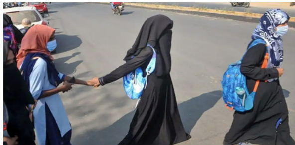
Figure 5: Muslim students in Karnataka denied entry into IDSG Government College, Chikmanglur due to the institution's discriminatory policies towards hijab wearing students.

“Meri dhadkan khatm ho gayi hai. Sar aur chest mein hamesha dard rehta hai.