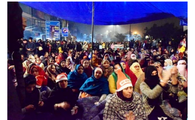
Figure 10: The sit-in at Shaheen Bagh, Delhi, January 2020.

"We are reminded on a daily basis that our voice and existence are illegal; there is no one to go to for help. I don't have words to express myself; I'm not able to react. How do I tell you what is happening and what will happen in the future? I've lost the words to react. How do I help another person; tell them to remain brave, tell them that we have to come out on the streets and fight back; how long do we keep telling people to be brave and give them solace; how long can I wait till things get better? Because nothing is getting better."